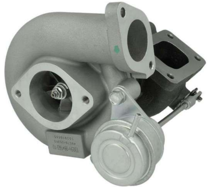
Click image to view more.